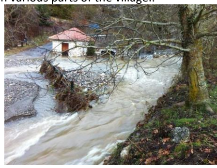
The overflowing of the river

On Wednesday February 6 , the disasters caused by the severe weather conditions in Karyes were unprecedented. After many days of continuous heavy rain , the soil did not bear to absorb any more water and landslides were caused in various parts of the village.