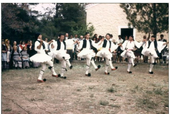
At the St. Constantine's fest

Thereafter, the Athletic Association "Karyatis" implemented their initiative to create a dance club in the summer of 1992 . What motivated and inspired the leaders of this project was the love they shared for authentic tradition, folklore, customs and beliefs, and traditional Greek dances.