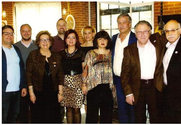
The board members of the Karyates Association

The 2019 Association's Annual Dance was successfully organized. One more time many compartiots not only from Athens, but also from other cities and towns of Greece gathered together. On Sunday February 10<sup>th</sup> Karyates enjoyed a tasteful meal and danced at the "CAPETANIOS" hall.