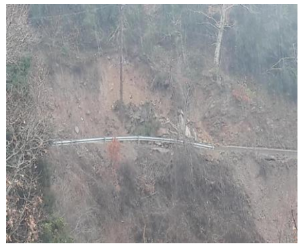
The road to the hotel